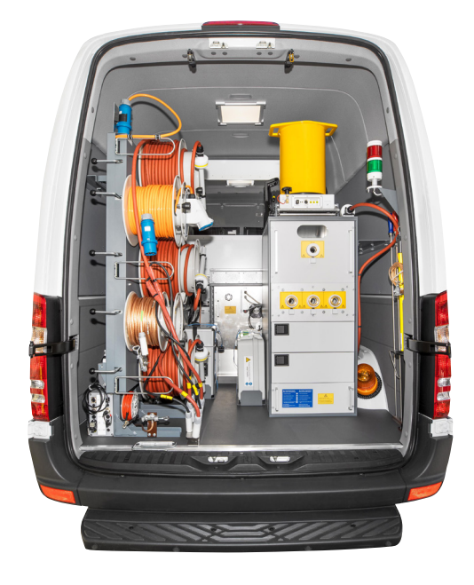
Example of integration in a cable test van

Prerequisite: Availability of the corresponding software functions of the BAUR Software 4.