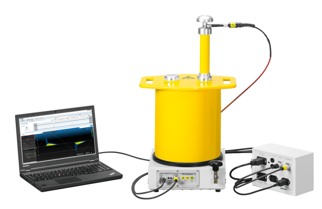
Figure: PD-TaD 62 with laptop and Power Box