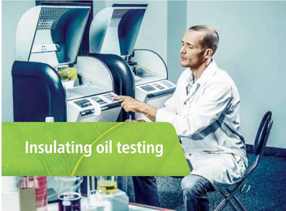
Insulating oil testing

Oils are used for insulating electrical systems. They lose their insulating and cooling properties due to impurities and ageing. Our testing devices are well thought out right up to the smallest details. They include all important test procedures. In addition, our devices convince with their highest quality, reliability and precision – for the safety and efficiency of our customers' plants.