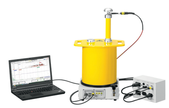
Figure: PD-TaD 62 with laptop and Power Box