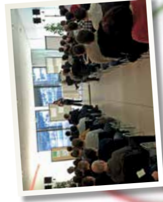
Company Values Day in Bregenz, February 2013