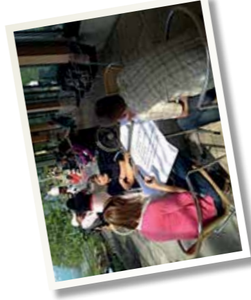
Values Workshops 1-4 in Viktorsberg, May - July 2012